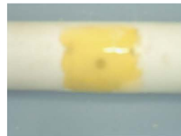
4. Finished repair.