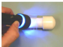
5. Shine NSR High Intensity Light directly on the applicator tab/resin for 30 seconds or until fully cured.