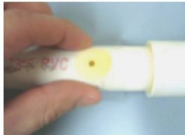
4. Using NSR Tab, apply gentle pressure.