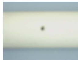
1. Quarter inch hole.

For larger holes (1/4" or greater) use of fiberglass mesh is recommended. Lay fiberglass mesh on NSR Applicator Tab. Apply resin to mesh material so it is fully moist. Follow steps 4 & 5 from above. Apply a second coat of resin on top of mesh to insure a strong repair. Sand off any fiberglass strands. Do not pull.