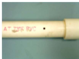
1. Pipe with pin hole. Relieve pressure. Surface can be wet or dry.

Syringe cap twists on and off for multiple uses of resin. The product is light sensitive and exposure to daylight will initiate curing process. When cured in an open-air (oxygen) environment, a slightly tacky surface will result. Use of North Sea Resins® (NSR) applicator tabs are recommended for applications that prefer a tack-free surface. A light sanding with 150 grit sandpaper is recommended prior to application of the resin. For optimal adhesion, the surface should be clean of dust and dirt. An important consideration is the resin will cure-on-command only if the appropriate light reaches the resin.