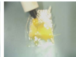
2. Apply resin to tab/mesh until fully moist.