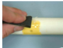
3. Sand fibers.