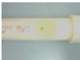
6. Remove NSR Tab. Completed repair. Note resin covers an area larger than the actual hole.

For larger holes (1/4" or greater) use of fiberglass mesh is recommended. Lay fiberglass mesh on NSR Applicator Tab. Apply resin to mesh material so it is fully moist. Follow steps 4 & 5 from above. Apply a second coat of resin on top of mesh to insure a strong repair. Sand off any fiberglass strands. Do not pull.