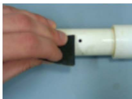
2. Clean/roughen area with 150 grit sandpaper.